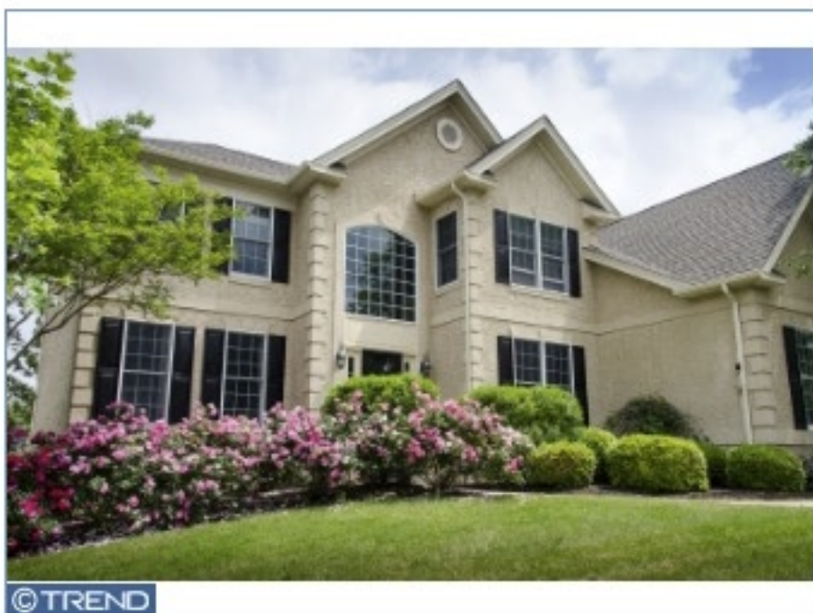
1 of 25 Exterior Front