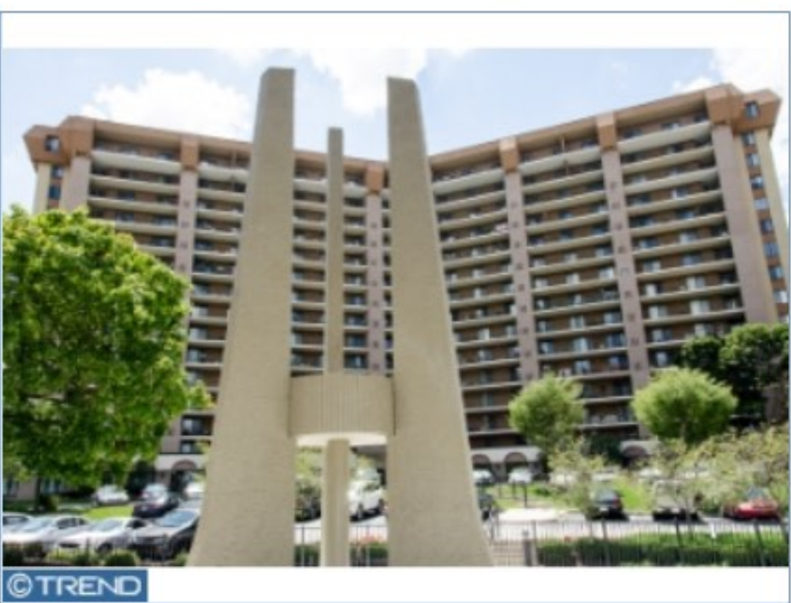
1 of 1 Exterior Front